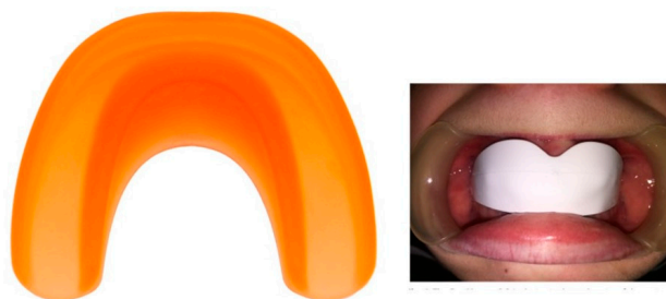
Figure 1. The Equilibrator Eptamed C3P orange and the Equilibrator C3P white in the oral cavity of the patient.

by their extreme simplicity in terms of their use by the patient, their safety, and their construction. Elastodontic devices allow the dentist to finalize the treatment and create a harmonious and natural smile obtained using comfortable and non-invasive appliances. The aim is to achieve balance in the oral cavity without creating problems in other areas of the body. All of this can be obtained by stimulating the patient to use their own strengths (tongue and chewing muscles) and enabling their natural growth and remodeling potential to solve the problem of malocclusion [4,5]. For this reason, it is also called an activator or equilibrator (EQ) device. In selecting the most suitable device for the individual patient, after taking alginate impressions and developing cast stone models, the orthodontist uses an appropriate ruler to measure the distance between the palatal cusps of the first upper bicuspids (or the first upper deciduous molars) and will then choose the correct size. Three different materials are available based on hardness: white in natural rubber (soft), and orange or mint in elastomeric resin (medium and hard, respectively). The patient inserts his or her teeth in the upper and lower splint fittings as shown in Figure 1. This device is functionalized through soft elastic forces, led by muscle energy, by biting into it. The activator is worn all night and for 1 h during the day [6].